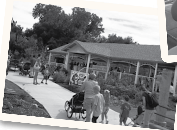
▲ Wild Tuesdays Storytime Safari has success in new location in the new Children's Zoo.