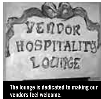
The lounge is dedicated to making our vendors feel welcome.

The Merchant Chair is responsible for the selection of merchants/vendors. She acts as the liaison between the vendor and the market. All contracts, correspondence, deposits and vendor issues are handled by her and her vice chair.