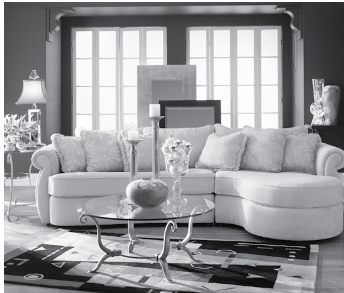
The Paramour Sectional by Norwalk Furniture

She is responsible for keeping track of all donations (monetary, material and in-kind) for MM and making sure they receive the appropriate recognition.