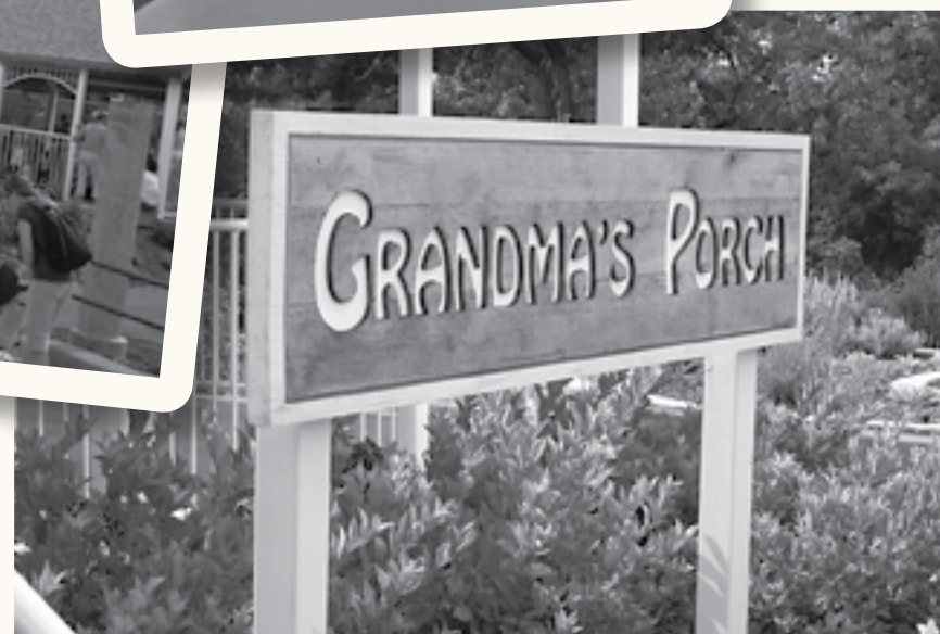
► Children and parents gathered on Grandma's Porch to hear stories, do crafts, and visit with zoo animals.