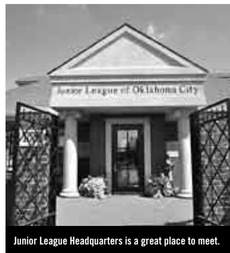
Junior League Headquarters is a great place to meet.

book your meeting! You should know, however, that the room rental doesn't come with coffee. JLOC has coffee makers (large and small) anyone can use, and our renters are welcome to use any paper products or coffee enhancements (creamers, sugar, etc.) they find – and there are TONS, both in the large conference room and in the kitchen. JLOC cannot provide the actual coffee, though. And it wouldn't be a bad idea to bring coffee filters either. Once I used a paper towel – only once! As you mentioned, there is a lot of tea. Lots of lemonade and hot chocolate too! Use it up! FYI, that soda over in the corner of the kitchen is yours for the taking too, but it's probably flat! Have a great NEXT meeting at HQ!