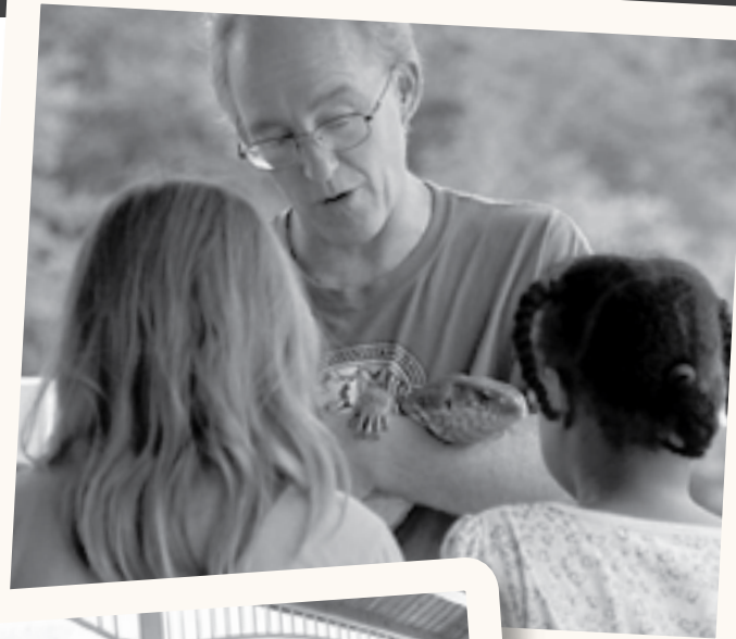
▲ a visit from a zoo animal makes for a great morning.