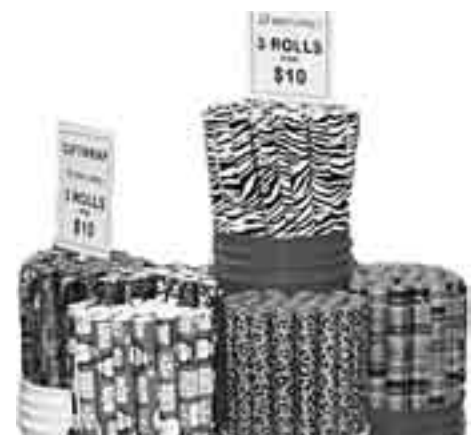
Don't forget to stock up on wrapping supplies, a favorite market stop.

122ND & N. MAY • 748-5774 NORWALKFURNITUREOKC.COM