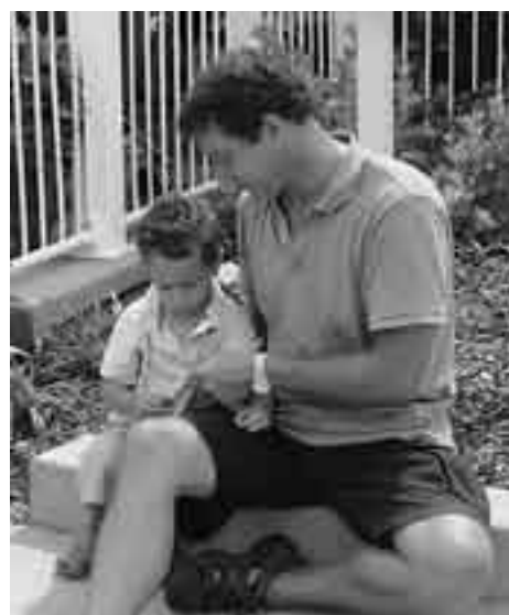
Father and son enjoy a morning at the OKC Zoo after Storytime Safari.