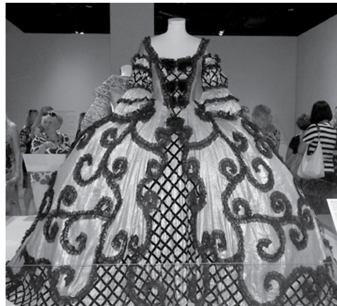
A piece from the Sketch to Screen: The Art of Hollywood Costume Design exhibit at the Oklahoma City Museum of Art.