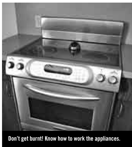
Don't get burnt! Know how to work the appliances.