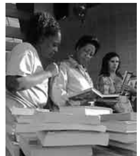
Choosing a book is hard with so many choices.