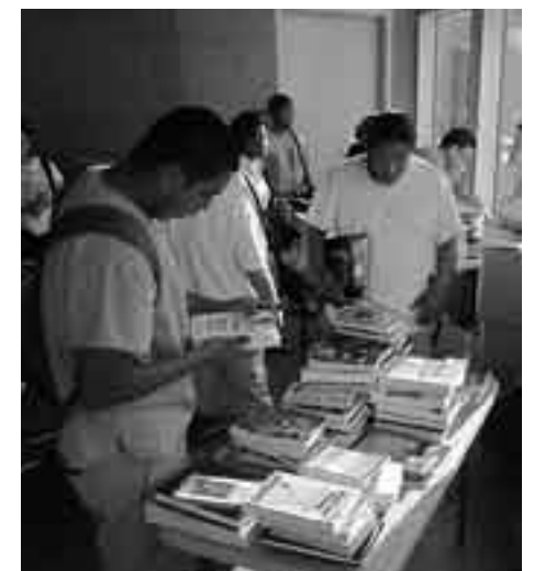
Over 2,000 books were distributed to Metro Area Transit riders on Friday, August 13th.