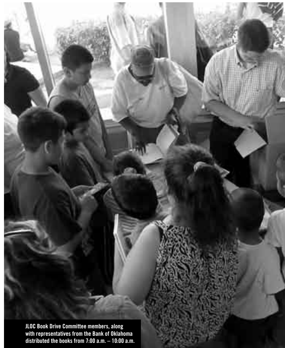
JLOC Book Drive Committee members, along with representatives from the Bank of Oklahoma distributed the books from 7:00 a.m. - 10:00 a.m.