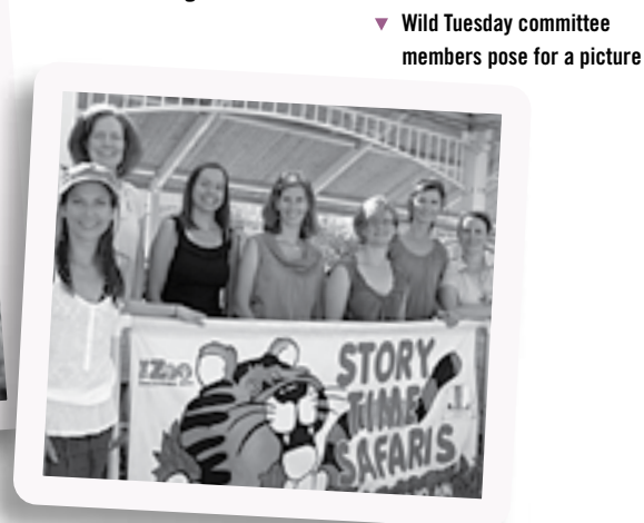
Wild Tuesday committee members pose for a picture