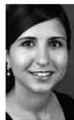
SORMEH SLATER HOMEoklahoma.com

sold ARBOR CREEK 241 Nature Lane $219,500 3 bedrooms, 2 bathrooms | 1602 sf (appraisal) | year built 2009 like new, loaded with upgrades