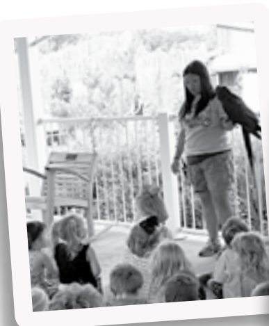
Families learn about different zoo animals throughout the summer