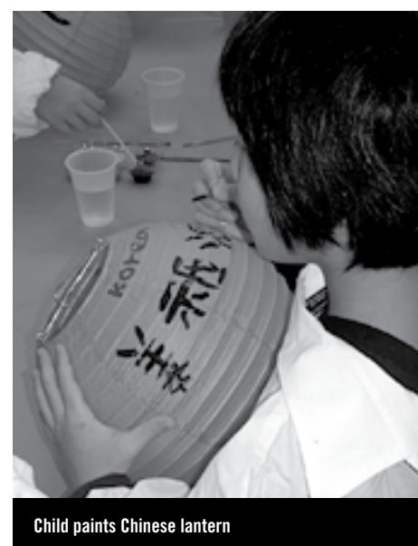
Child paints Chinese lantern