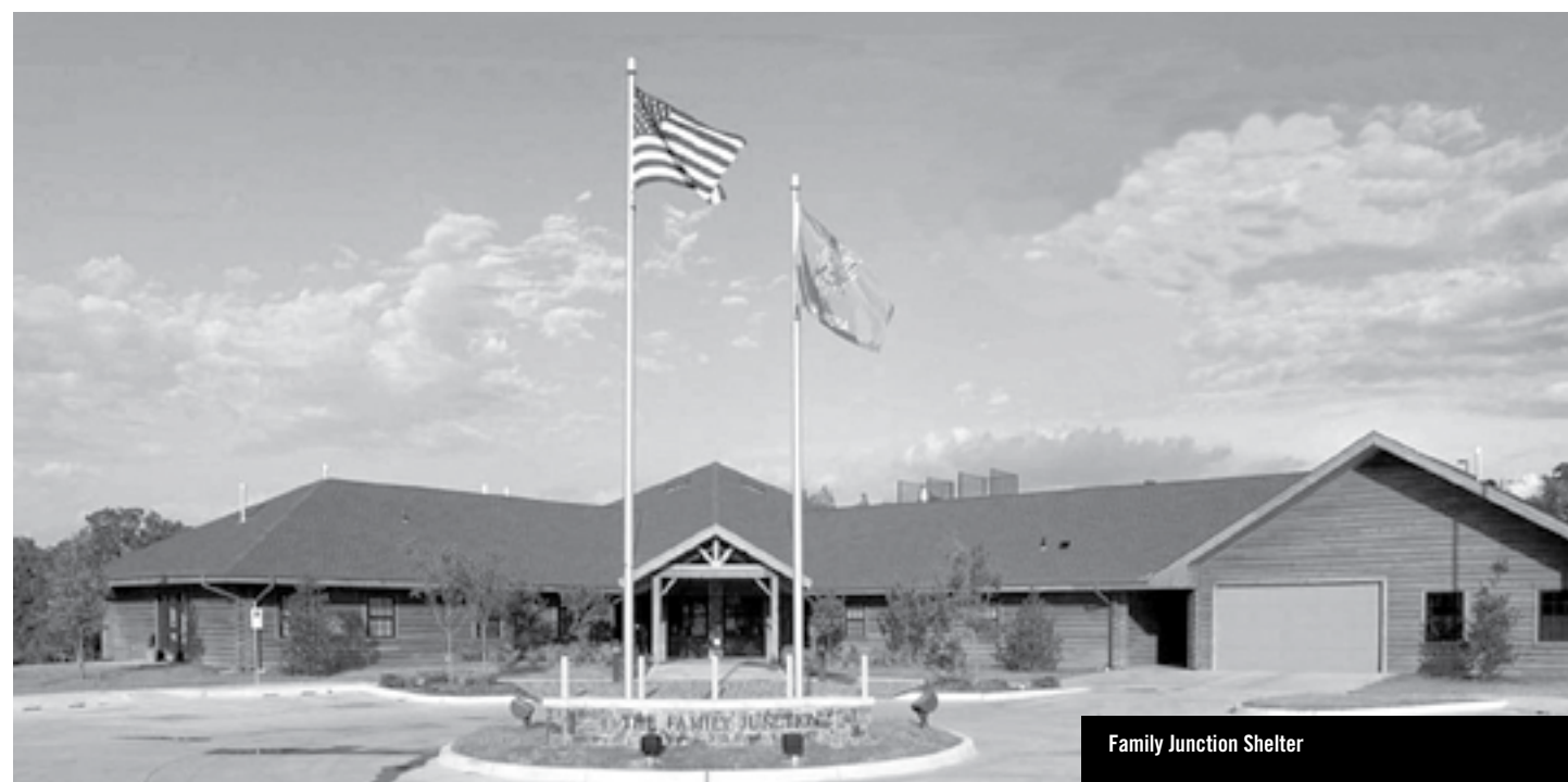
Family Junction Shelter