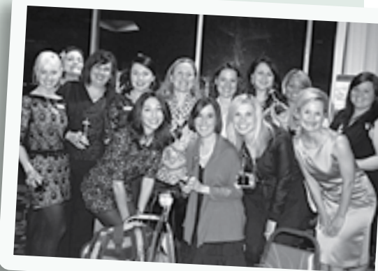
Thank you to the 2011 - 2012 Community Project Managers