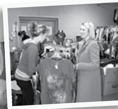
▲ Provisionals are all smiles sorting through a rack at the Shop