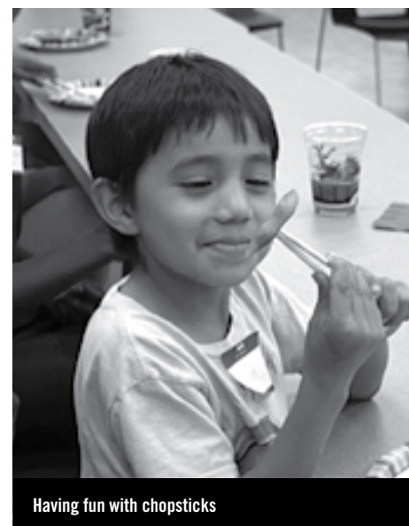
Having fun with chopsticks

It’s exciting to see the children make a new discovery during each class time. They are so proud of their art projects and leave with smiles on their faces as they show off their creations and dive into their new books. Cultural Literacy gives these children the chance to connect with other cultures without leaving their library. We are looking forward to finishing the spring with several more trips around the world!