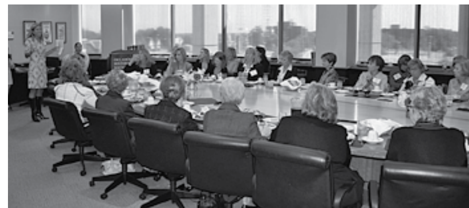
Over 30 past presidents filled the History Museum for a luncheon