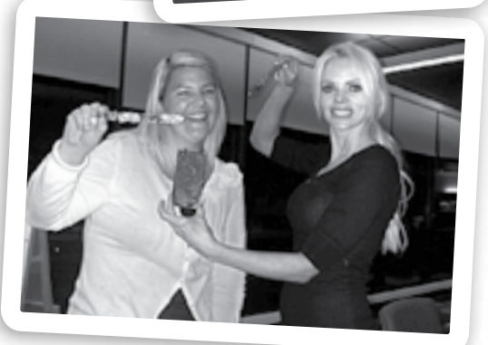
JLOC members bring smiles to patients during the Holiday season