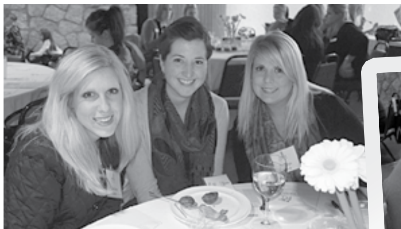
▲ Provisionals catch up at the November meeting.