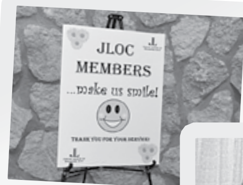
► Great job to the Membership board for such a fun themed meeting.