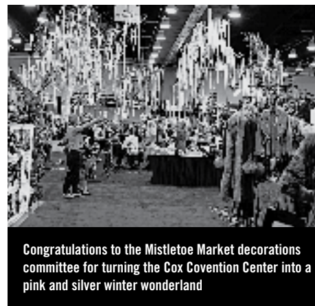
Congratulations to the Mistletoe Market decorations committee for turning the Cox Convention Center into a pink and silver winter wonderland