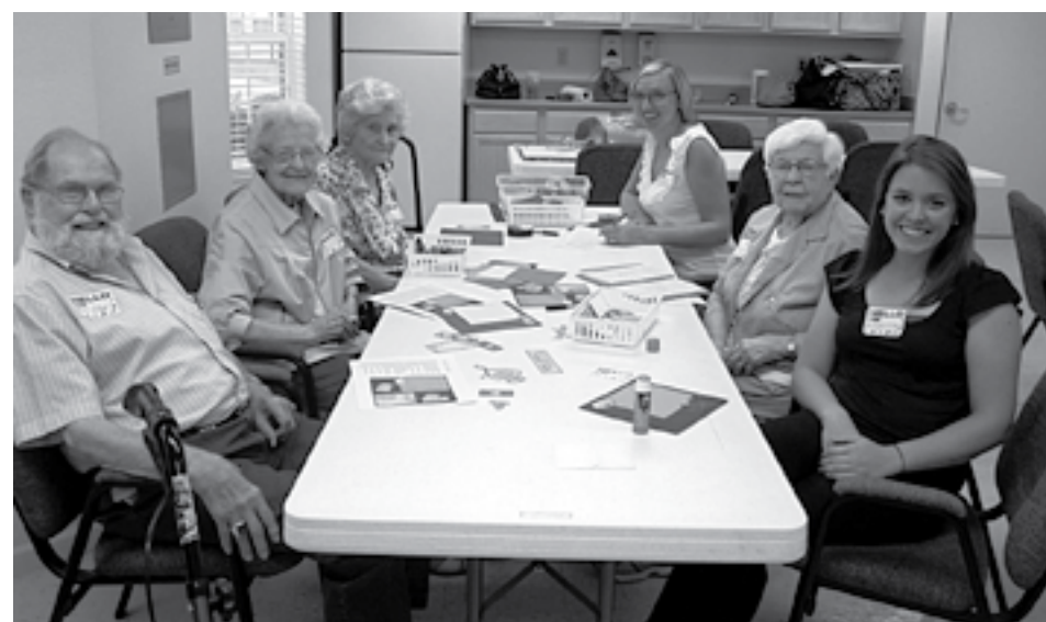
Ann's residents and Junior League members put together scrapbooks