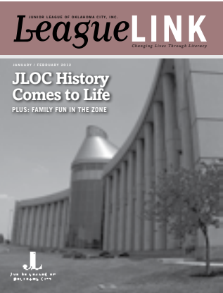
ON THE COVER: The Oklahoma History Center, Oklahoma City.