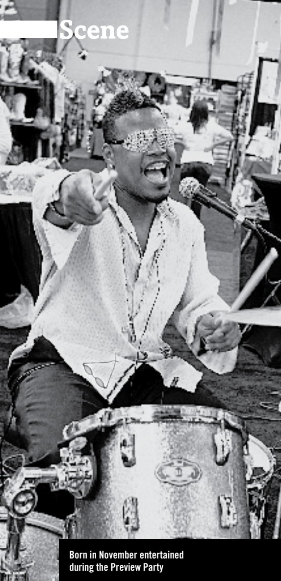
Born in November entertained during the Preview Party