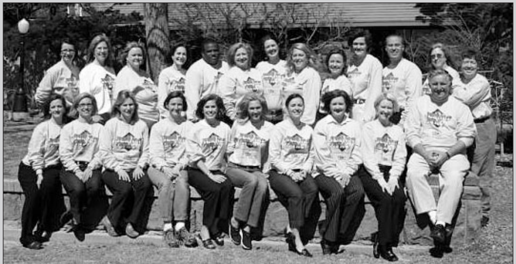
The Jungle Gym project has been a tremendous success, thanks to the hard work of these dedicated folks!